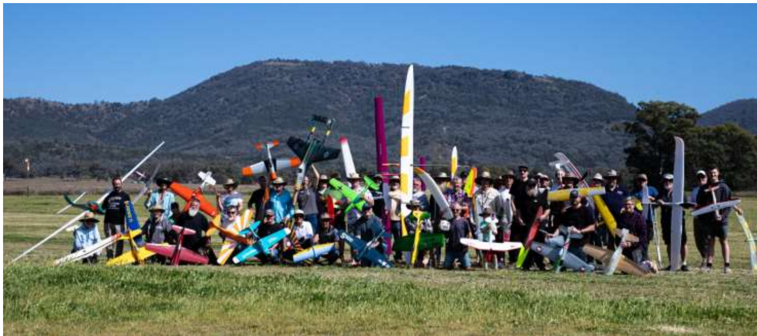
Many pilots showed up for the memorial slope fest.