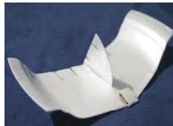
FPG-9 foam plate glider (above – from AMA website).