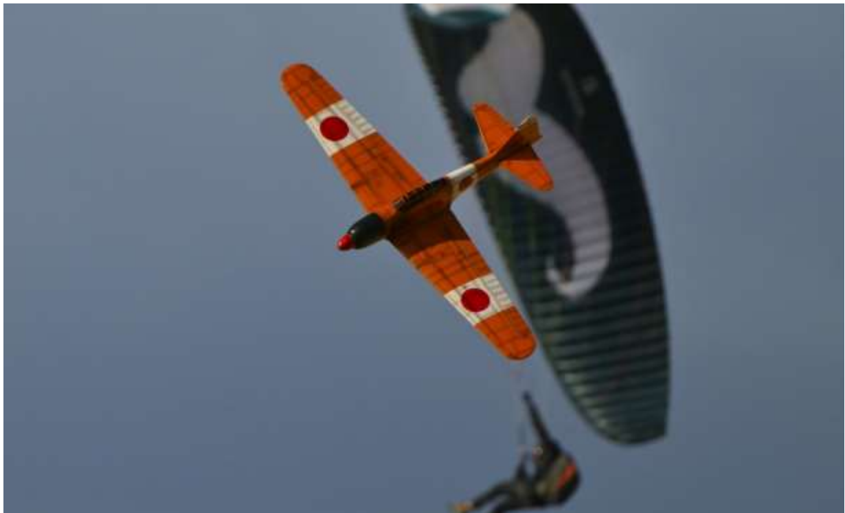
PSS Zero with paraglider in the background over Torrey