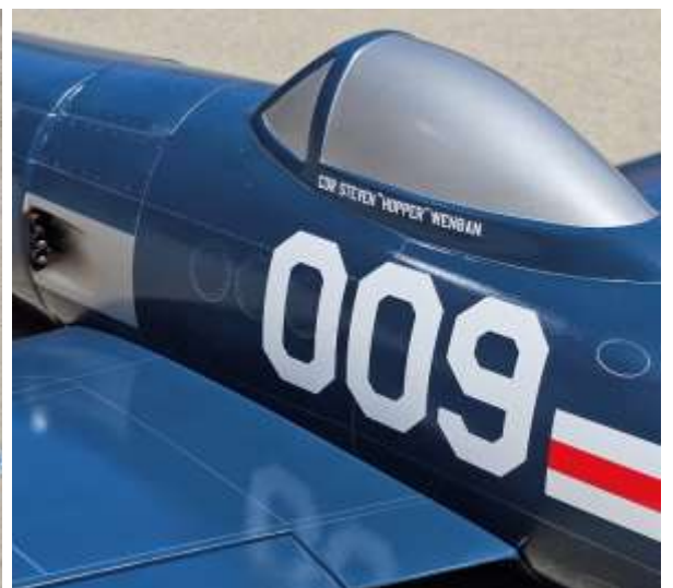
Note canopy detail and 009