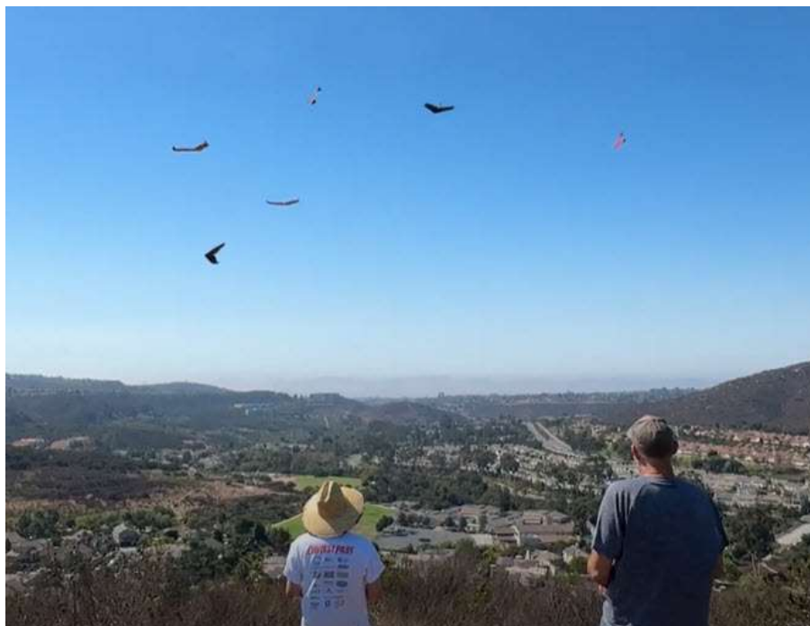
2024 Slope Combat in Poway