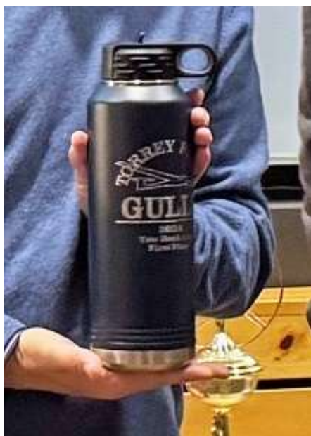
2024 trophy award: engraved 1-liter water jug