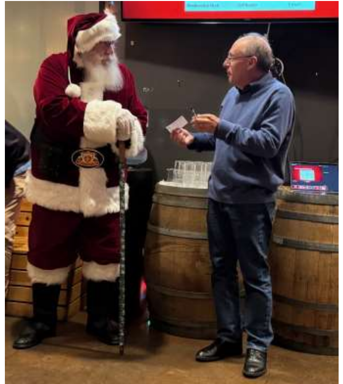
Santa Claus telling us about all of the amazing thermal and slope lift that awaits all of the good girl and boy modelers