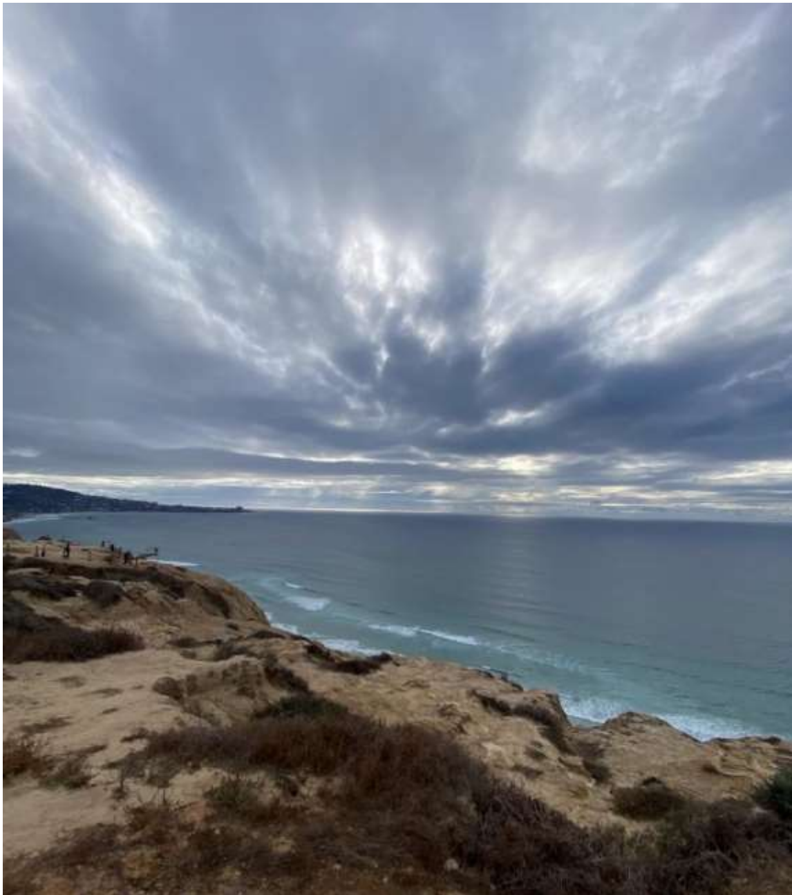
Torrey Winter Solstice