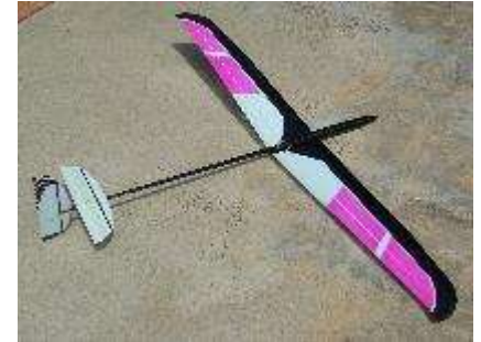
Predator II (Yeah...some zebra stripes on the tail 😊)