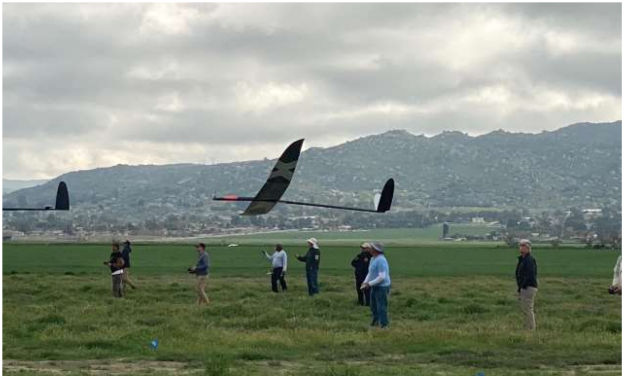
F5J launch at Perris contest in Marc, 2023