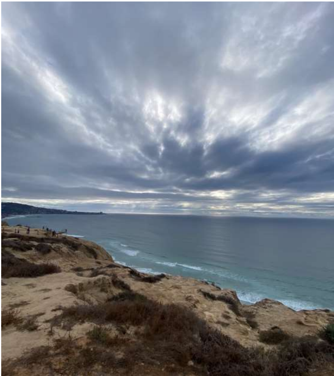
Torrey Winter Solstice