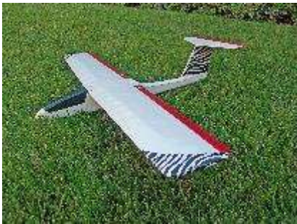
Ridge Runt (rebuilt and recovered)