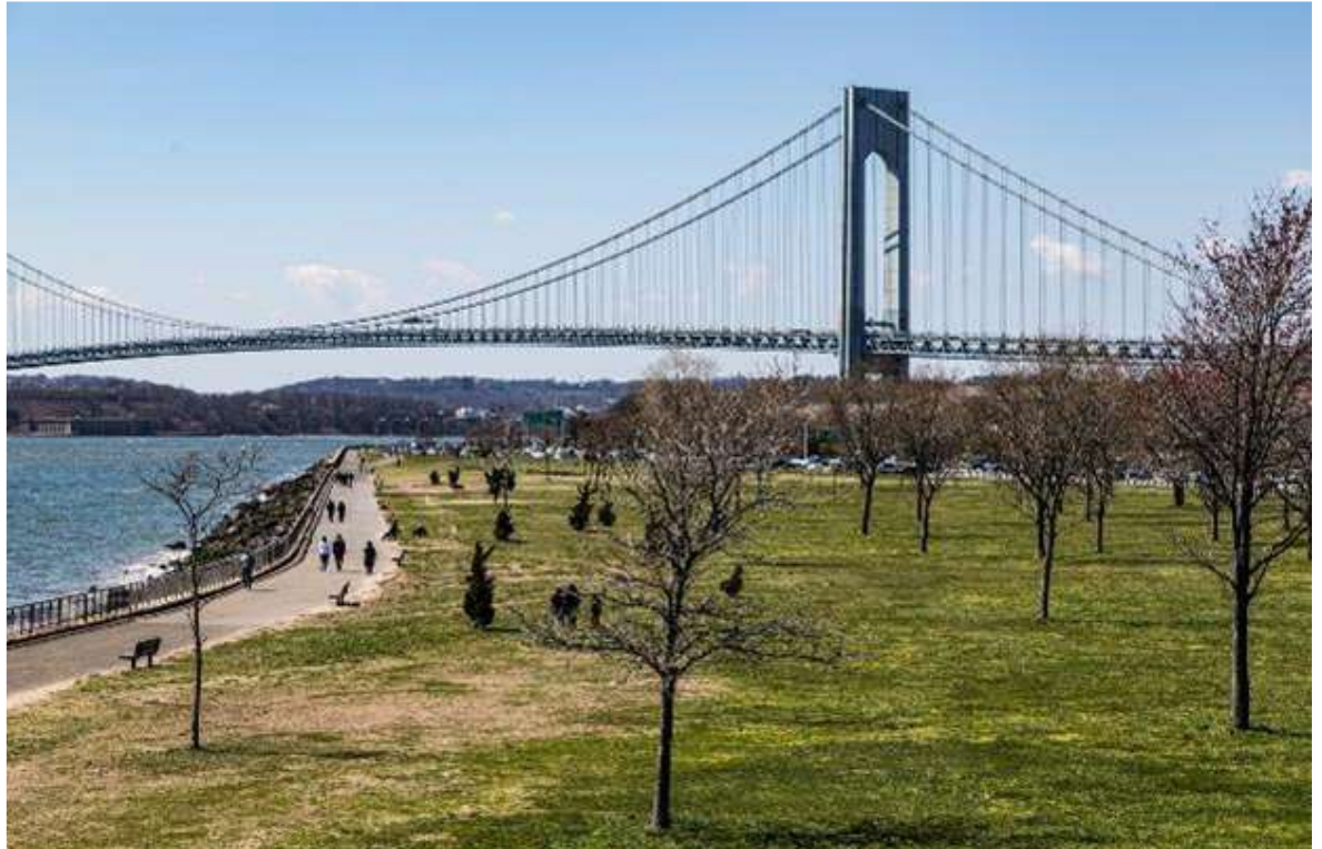
Rest stop/park south of the Belt Parkway near the Verrazano Narrows Bridge in the Bay Ridge neighborhood of Brooklyn. Unfortunately, kite flying was prohibited several years ago, apparently due to driving distractions.