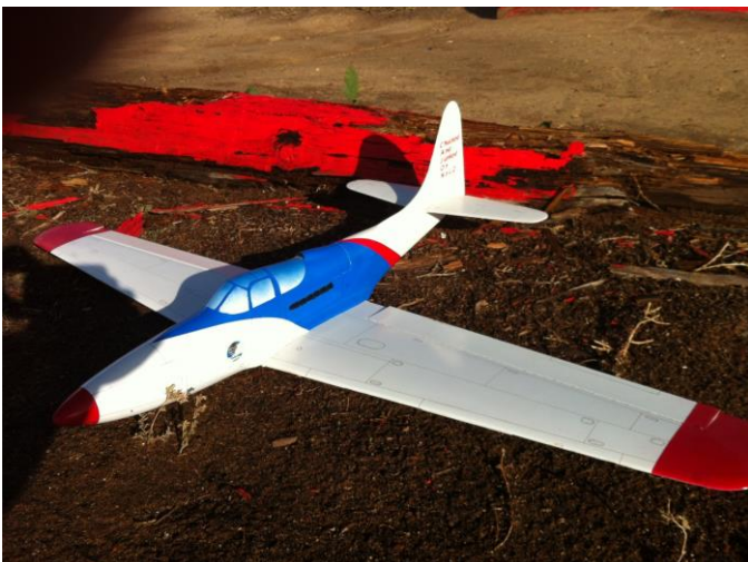
Greg Houck's PSS P-39.