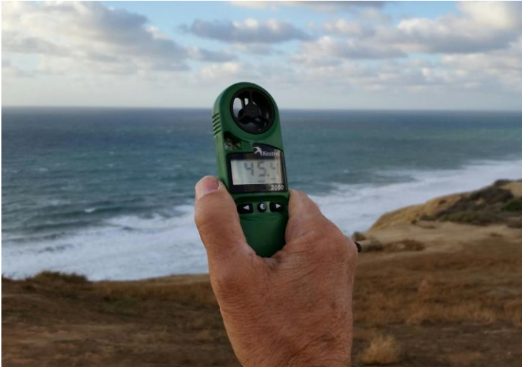
45 mph gust.

Rarely do you see a Skua, two Mach Ones and three Blutos at the bluff, but this day brought them out of the closet. I, unfortunately took few photos, but I stole a couple from RCGroups.