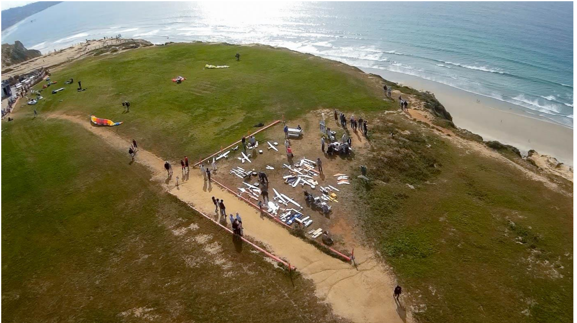
Bird's eye view of the Gliderport