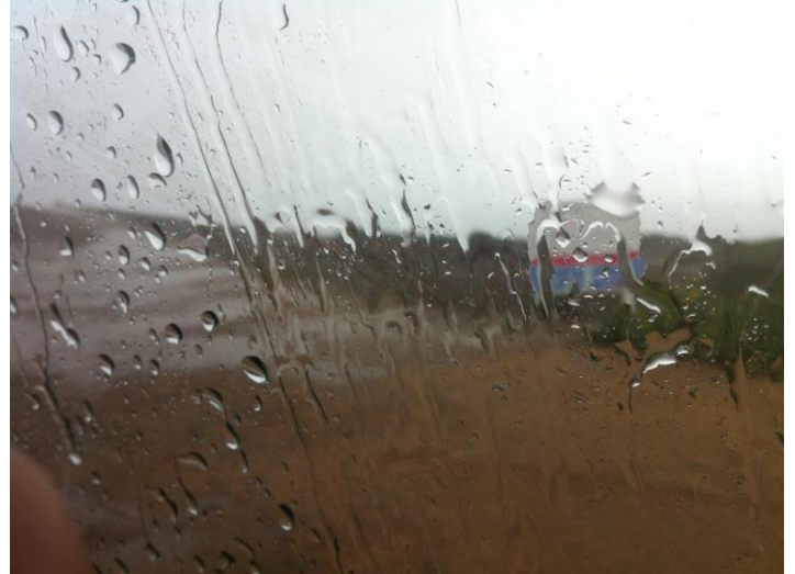
Rain squall.