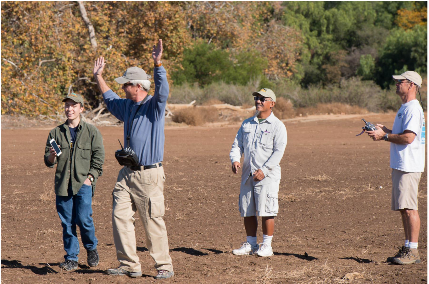
All in all, a great day!