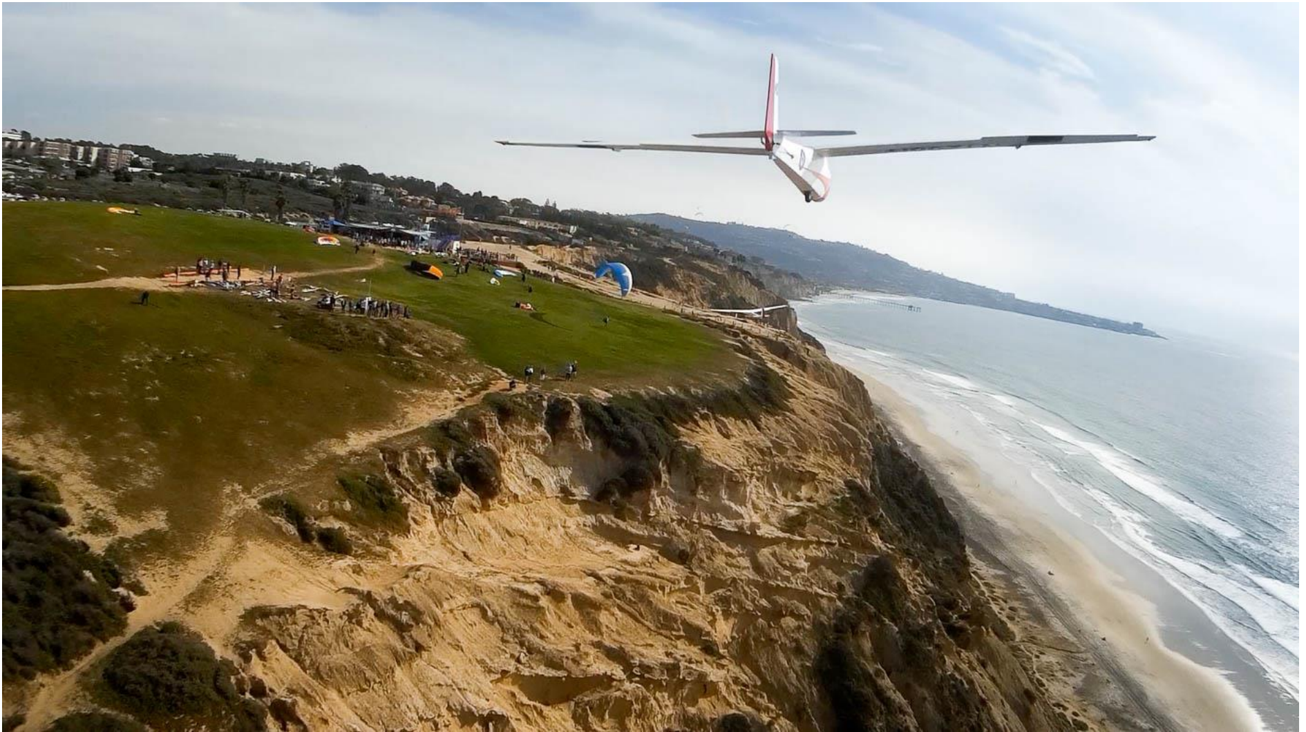
Ka-8 over Torrey - coming up on the Gliderport