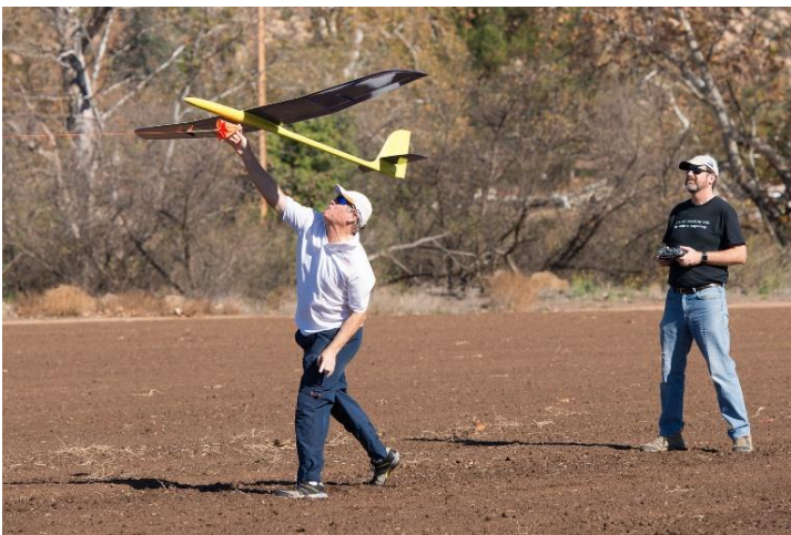
This is how you launch a moldie.