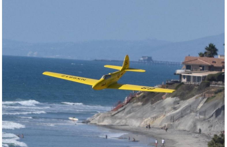
November Contest (Greg Houck) Jim Scott's Lightweight Cobra on a pass over Dave's Beach