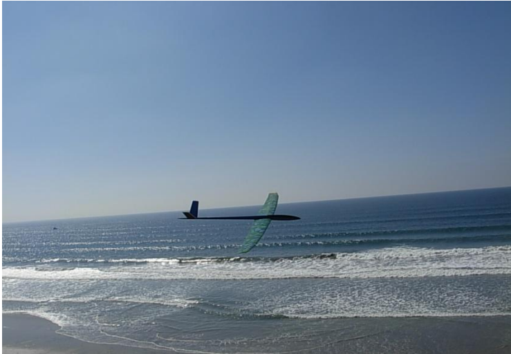
November Contest (Oran Bloodsworth) Scepter Re-Maiden over Dave's Beach