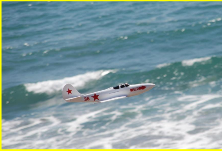
July Winner (Matin Taraz) Greg Houck's One Day Build P-39 Maiden at Dave's Beach